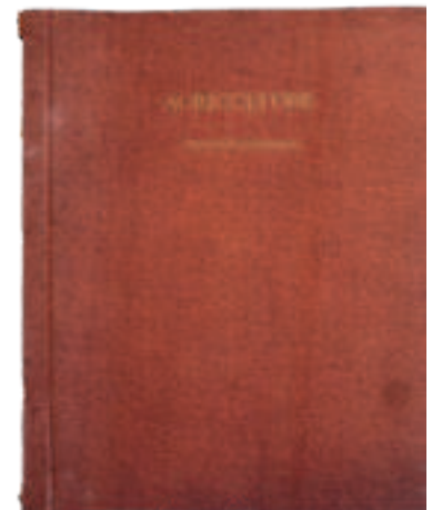
Fig.2. First English edition of the Agriculture Course: Front cover